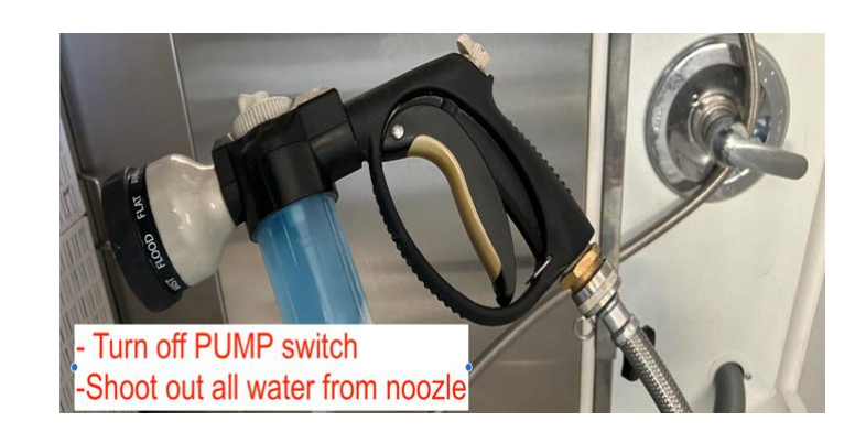
Steps 2, 3 and 4